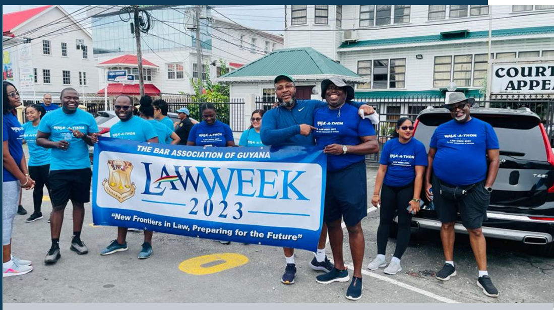
Finish Line of the association's 2nd annual Walk-a-thon held on 23rd April, 2023 to kick off Law Week 2023